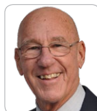
Hank Darlington Bath & Kitchen Showrooms